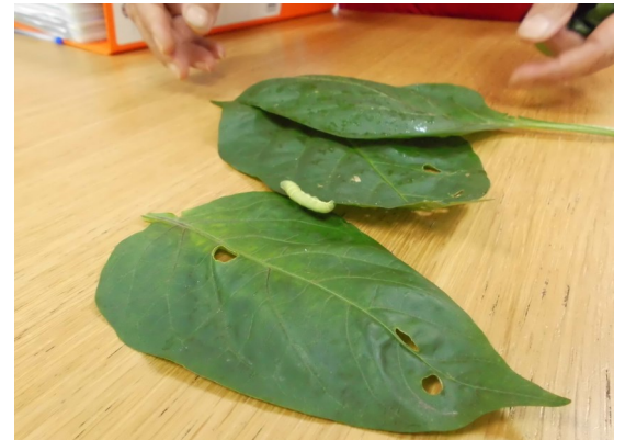
A caterpillar that the children found in the garden and fed it leaves.

Although we are thankful for the kind gifts that parents gave to the children over the summer, we would like to return to following our healthy eating policy. Please speak to Aisha or your child's key person.