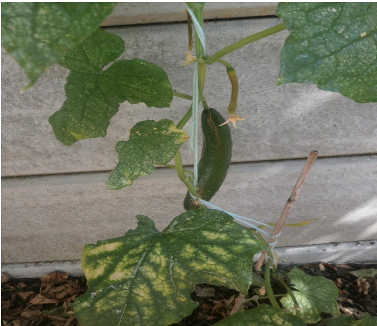
Iqbals growing cucumber

We are still continuing to have children being left unsupervised in the nursery when being dropped off or being picked up. Please can I remind you that the children must be with you at all times.