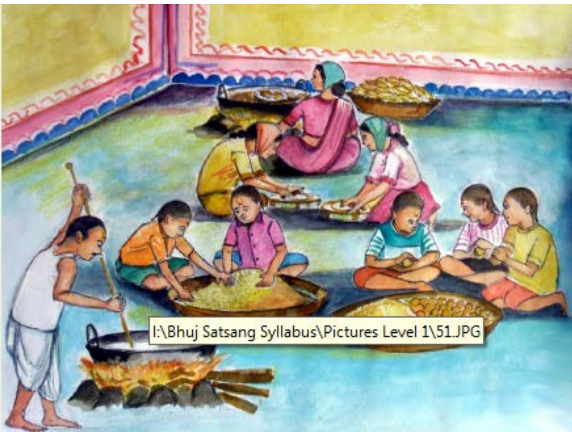
I:\Bhuj Satsang Syllabus\Pictures Level 1\51.JPG